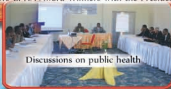
Discussions on public health