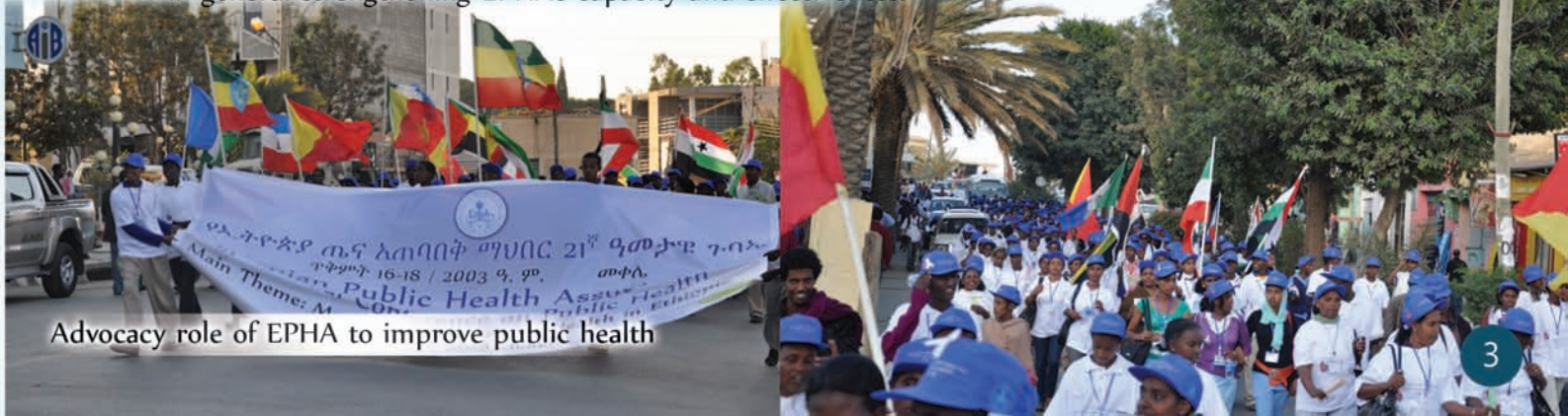
Advocacy role of EPHA to improve public health

Be EPHA Member and Make a Difference in Public Health