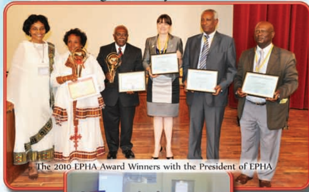
The 2010 EPHA Award Winners with the President of EPHA