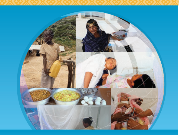
"Towards Global Health Equity: Opportunities and Threats"