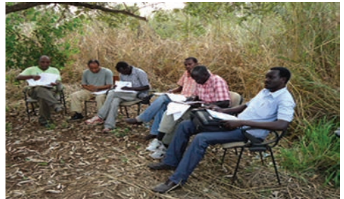
Omod Omod (R1)-3 rd cohort resident collecting data during the health emergency need assessment in November 2012.