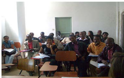
3 rd Cohort residents in class.