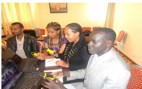
3 rd cohort residents practicing GPS operation and reading during GIS training