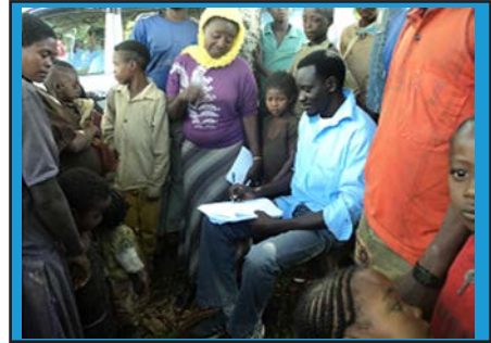
Omod Omod-3 rd cohort

Collecting data during a measles outbreak investigation Meta Robi Woreda, Wet Shewa Zone of Oromia Region in February 2013. Confirm the spelling of all residents' names.