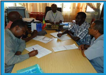
Omod Omod-3 rd cohort

Selecting controls for the meningitis cases in Mhea Village, Sheybench District of Arbaminch Zone of SNNP Region in 2013.