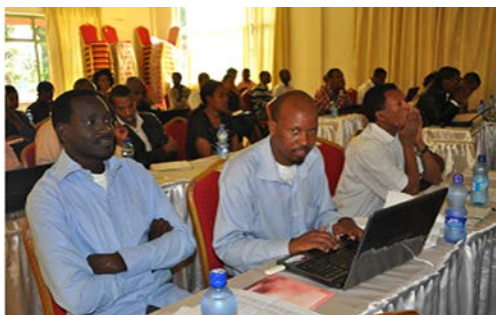
3 rd cohort residents participating in the 2nd PHEM Annual Review Meeting conducted in Bahirdar in April 2013.