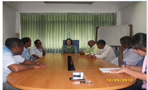
Ethiopia FETP Coordinators and Field Supervisors sharing experience from Thailand FETP in September 2012.