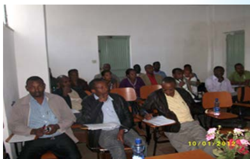
3 rd cohort residents' introduction to field base supervisors before deployment to field bases.